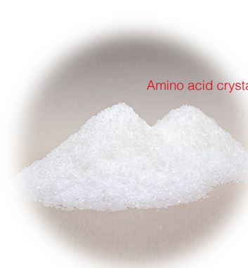
Amino acid crystal